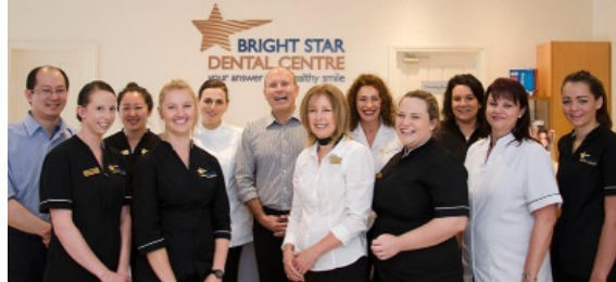
Bright Star Dental team

The team at Bright Star Dental is passionate about dentistry and creating beautiful smiles that will change your life.